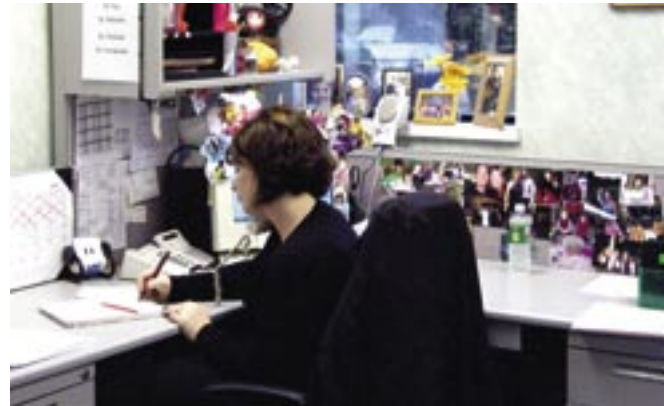
Taking an appointment at Northeast Orthopedics