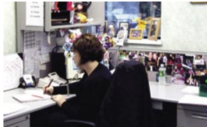
Taking an appointment at Northeast Orthopedics