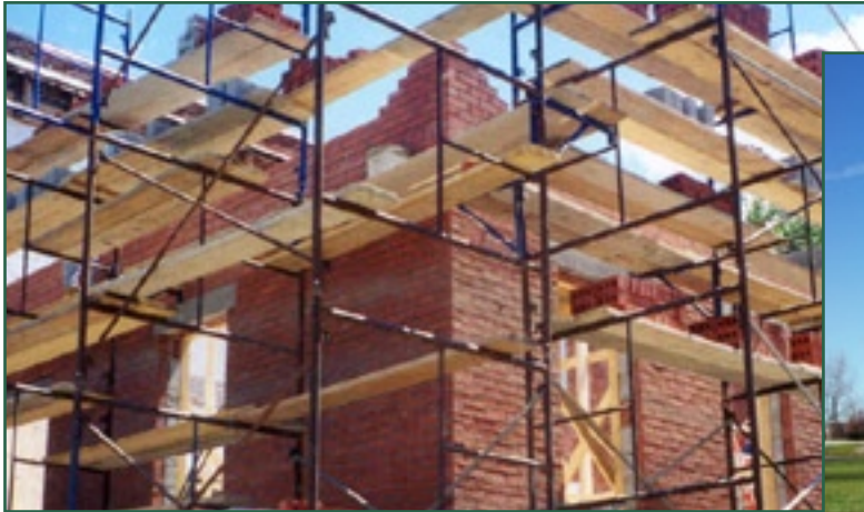
The Childrens' Museum at Saratoga Addition and Renovation

New Commercial Construction and Renovation