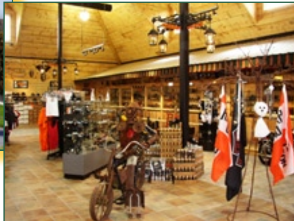
Brunswick Harley-Davidson Interior Finishes