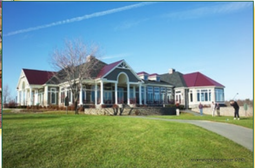
Van Patten Golf Clubhouse Construction Management