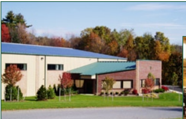
12 Enterprise Avenue New Construction